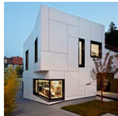
Individual housing | Croatia