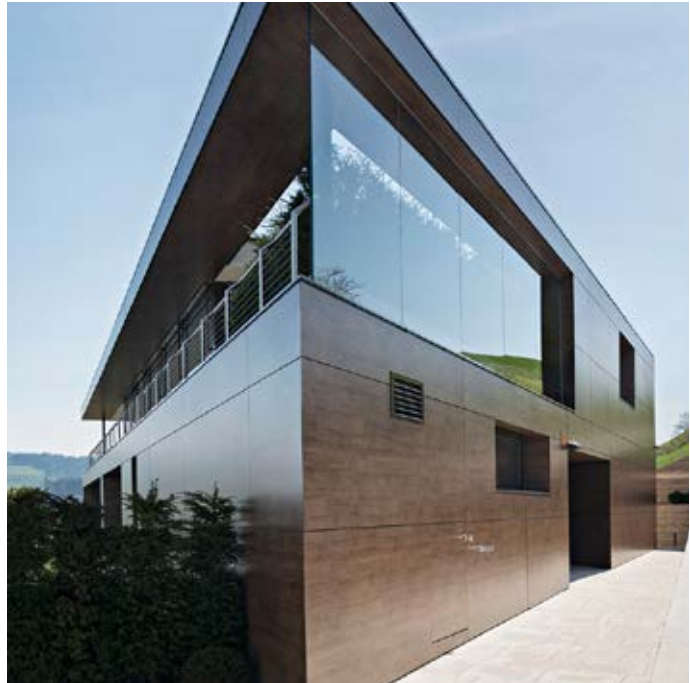
Individual housing | Switzerland