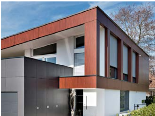
Individual housing | Switzerland