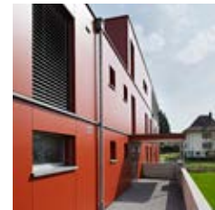
Private house | Switzerland

The closed surface of Trespa® Meteon® practically withstands dirt accumulation, keeping the product smooth and easy to clean. Contaminants like soot, crayons, graffiti and even permanent markers are easy to remove if the appropriate cleaning methods and products are used in accordance with Trespa's cleaning and maintenance instructions (trespa.info).