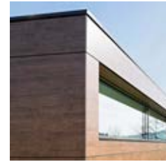
Private house | Switzerland

All Trespa products are tested under extreme conditions. Trespa's tests exceed the requirements of the European EN 438-2 standard. The panels' colour stability is tested according to the Florida cycle (comparable to exposure to the intense sunlight and humidity in Florida). Trespa offers a ten-year limited product warranty. Contact your local representative for further information.