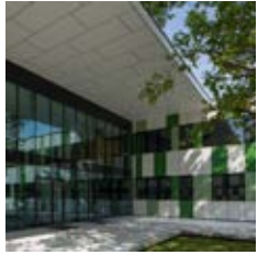
School | Austria