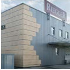
Retail | Switzerland

Trespa® Meteon® is not only visually attractive. It offers long-lasting aesthetic quality. So today's vision will remain tomorrow's reality.