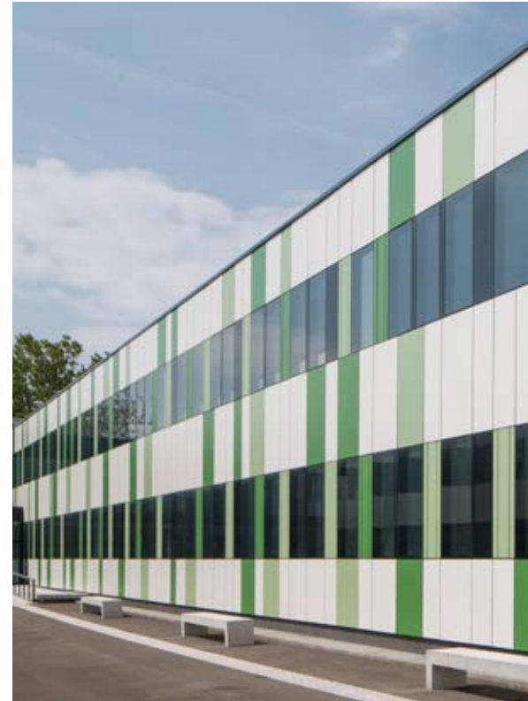
School | Austria

Low installation cost for the total façade solution.