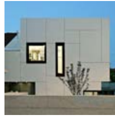
Private house | Croatia

Trespa's wide range allows you to match the colours of façade elements or dormer windows to those of other parts of the building. For example, the Trespa® Meteon® Matt lets you create a natural, matt look.